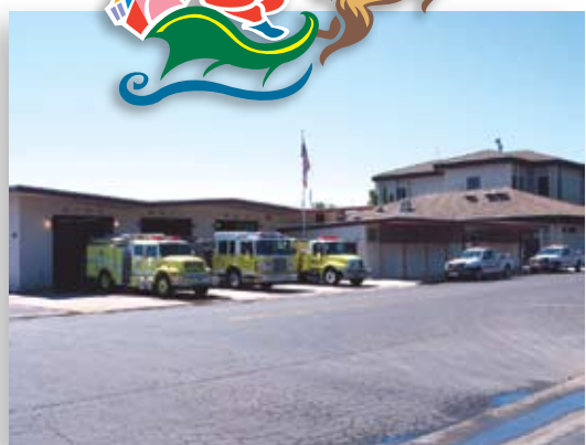
ANDERSON FIRE PROTECTION DISTRICT